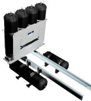
Plug & Drive H2 storage system