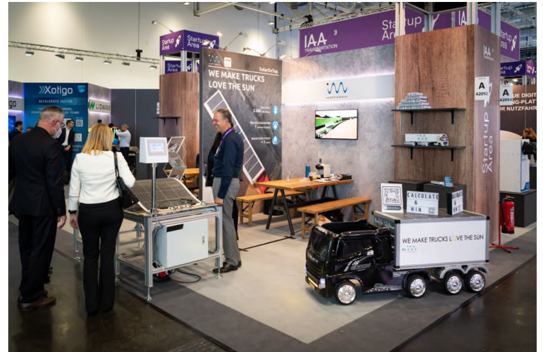
*Image is for reference and may vary from actual product.