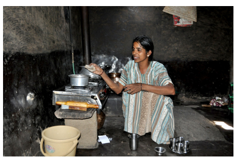
Cooking on the new cooker using the gas from the biogas plant. "We used 2-3 hours to collect fire woods every day. With biogas, it is very easy to prepare food."