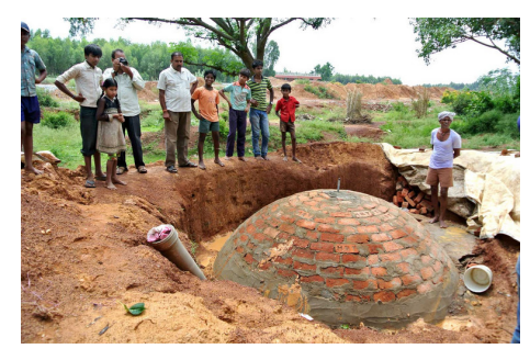
The biogas digesters use a simple, but effective and well tested technology.

Because the time-consuming collection of firewood is no longer necessary, children have more time to go to school and do homework. This gives each family almost 1.6 hours of additional time per day.