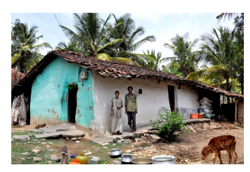
Biogas flows directly from the digester through the cable into the house. This couple is very happy with its biogas plant.