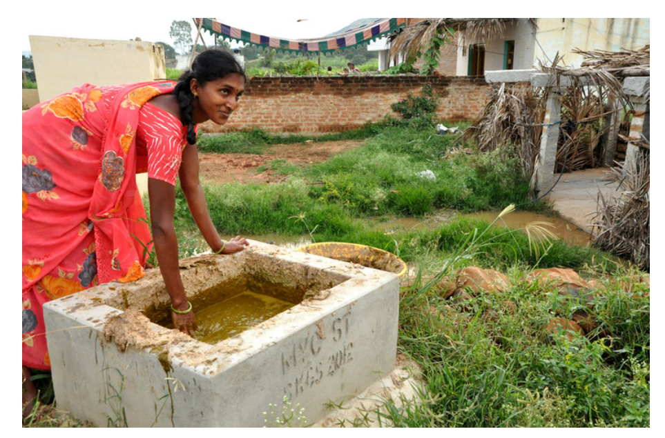
Cow dung and water gets mixed in the inlet. The inscription on the inlet serves transparency reasons. The tracking-unique-identity-code is also helping to keep quality standards up. 'myc' stands for myclimate.

The installation of domestic biogas plants substitutes the use of firewood and chemical fertilizers in the Karnataka region. In addition to the reduction of greenhouse gas emissions and less degradation of the forest people directly profit from higher crop yields and less indoor pollution. Moreover, the project will also reduce methane emissions from cattle manure.